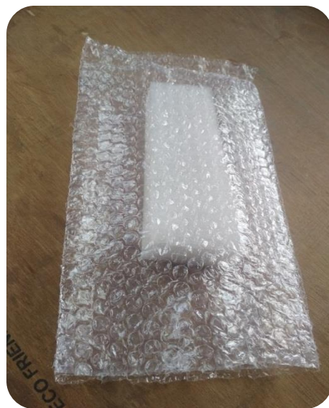
AIR BUBBLE BAG