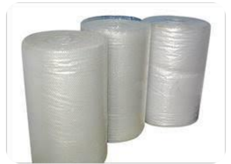
AIR BUBBLE SHEET