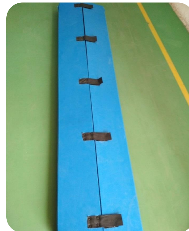
PP CORRUGATED BOX