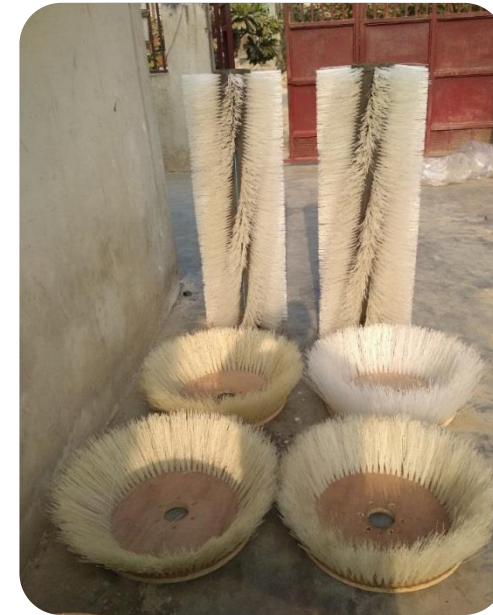
CENTRE & SIDE BRUSH