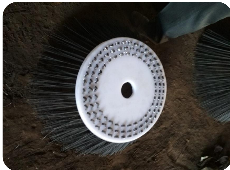
SIDE BRUSH STEEL