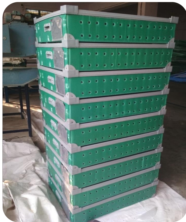
PP CORRUGATED BIN