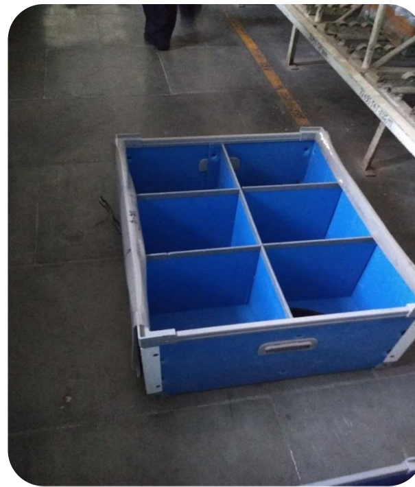
PP BIN WITH POCKET