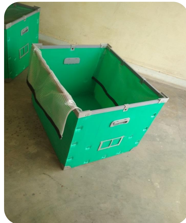
PP CORRUGATED BIN