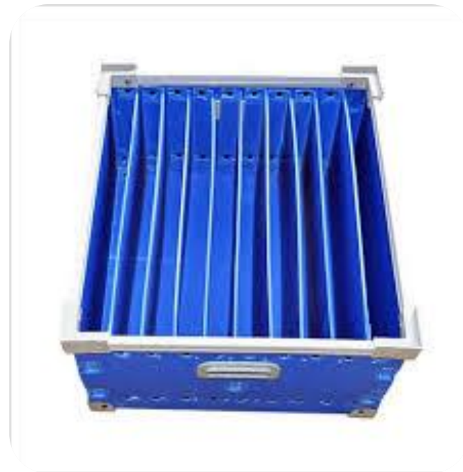
PP BIN WITH POCKET