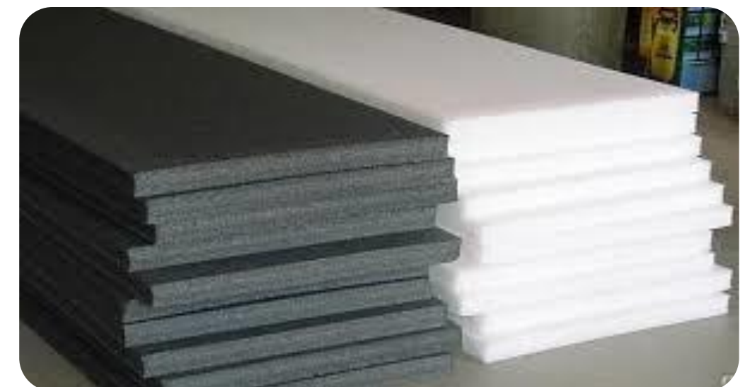
EPE FOAM SHEETS